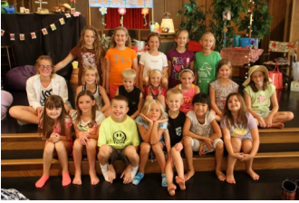
Aug. 6th– Two Special Worship Services: 8:45 & 10:30