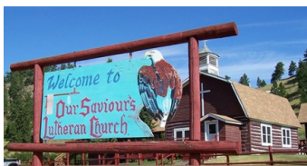
Donations support the Layette Ministry for new mothers.