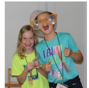
Volunteering is fun!