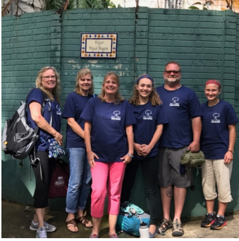
Our Guatemala mission team has returned safely!