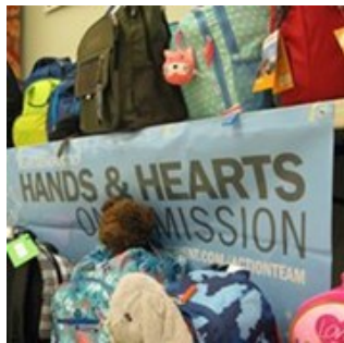
Collection begins July 27th!