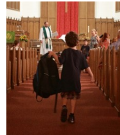
Back to school covered in blessings!