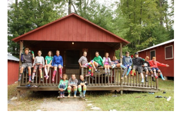
Registration is due August 27th

The cost is $90 per youth – friends are invited to join you. The deadline for registration fees and forms is Sunday, August 27th. Start collecting those crazy socks, get your forms in on time, and we'll see you in the fall!