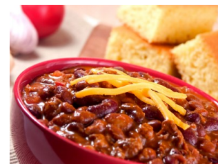
Friendly competition for Best Chili and Best Desserts

Please sign up in the back of the sanctuary.