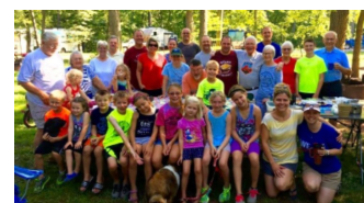
Everyone is welcome!