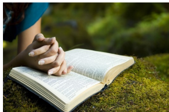
Join us for this year -long study.