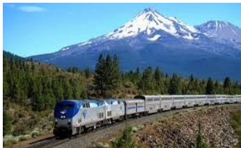
Everyone is welcome!