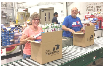
Sign up on the Outreach bulletin board.