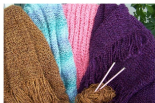
Comfort Stitchers meet the first Monday of every month.