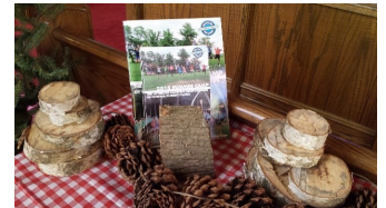
Summer Camp Sunday—April 2nd

Join us for camp snacks and fun on Sunday, April 2nd at all services. We'll have brochures for you to look at and past-campers for you to meet and ask questions to. Please join us and learn more about camps! Can't wait for April 2nd? Visit www.lutherancamping.org for more info today.