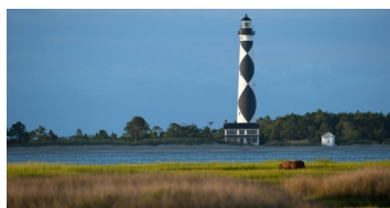
Join us February 26th & March 26th

sometimes discussion goes on past 11:00. Hope to see you there!