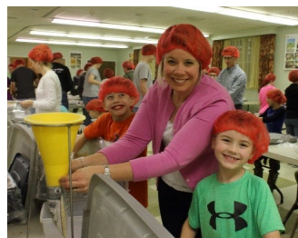
Trinity will pack 10,000 meals!

Join us for midweek Lenten worship and devotion at Trinity beginning March 8th.