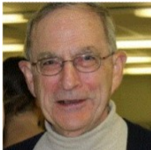
Everyone is welcome!