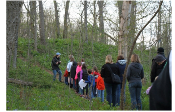
A fun night at BOLD!

Note: Children's Choir will not meet on this night.